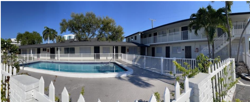
Renovation 1010 N. Riverside Drive