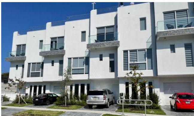
New construction – 1000 N. Riverside Drive